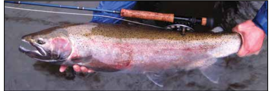
A Southeast beauty taken on the fly!