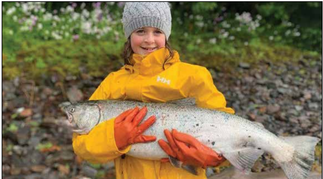
A good size king salmon ready for the table.

Get the latest fishing info emailed to you.